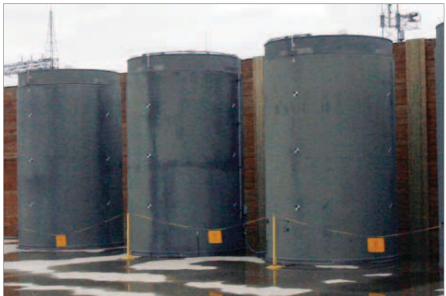
Dry casks are more secure than spent fuel pools, and with a few modifications could likely be made a viable storage option for at least 50 years.