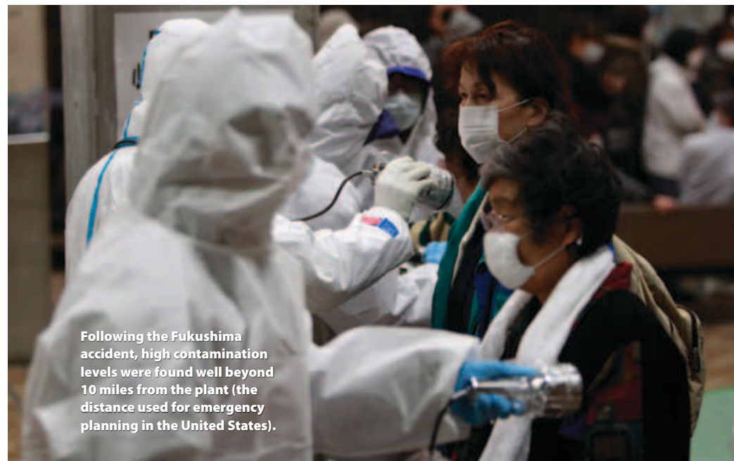
Following the Fukushima accident, high contamination levels were found well beyond 10 miles from the plant (the distance used for emergency planning in the United States).

In the United States, emergency planning for a nuclear reactor accident is limited