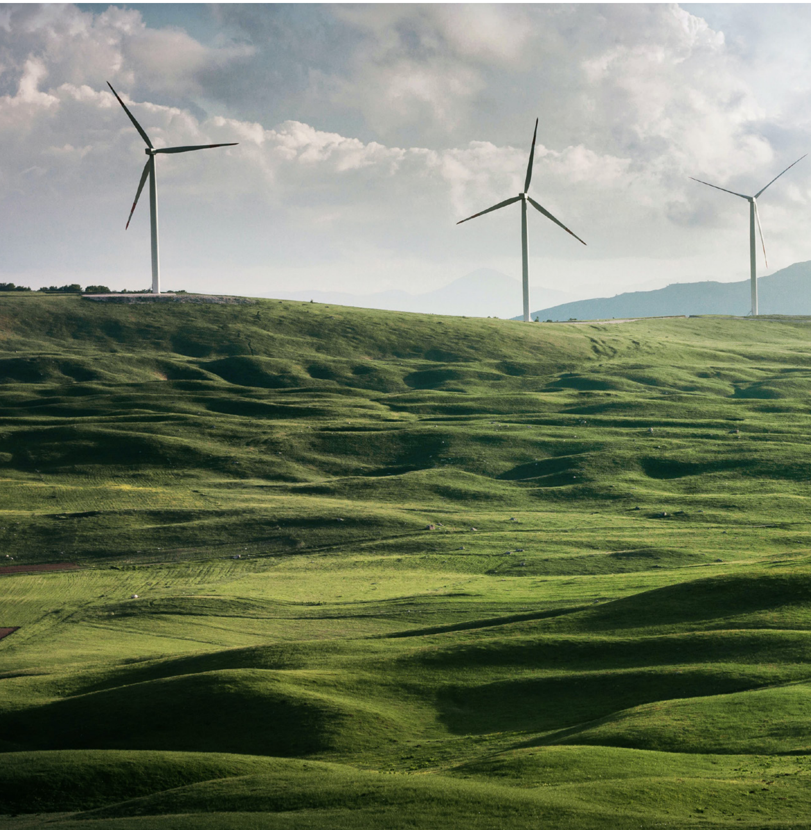
PHOTO CREDITS Front cover: Dennis Schroeder/GPA Photo Archive; inside front cover: Pixelci/Shutterstock; page 1: Richard Howard; page 2: Omari Spears/UCS; page 4: Francis Specker/Alamy; page 7: Johner Images/Alamy; page 8: TMimages PDX/Creative Commons 2.0 (Flickr); page 11: Gary Kavanagh/iStock; page 16: Appolinary Kalashnikova/Unsplash; back cover: Brenda Ekwurzel/UCS